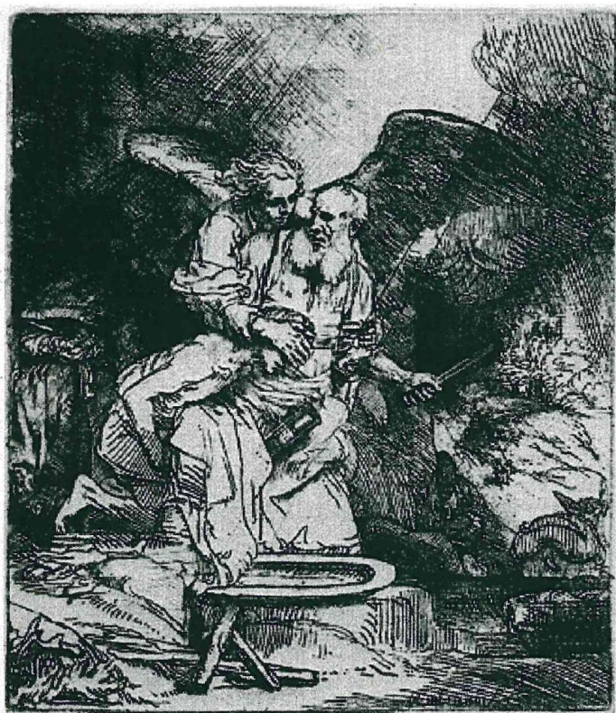
Rembrandt van Rijn (1606-1669) Abraham's Sacrifice 1655