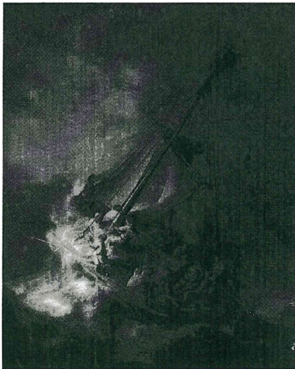
Christ in the Storm on the Lake of Galilee (1633) Rembrandt (1606-1669)