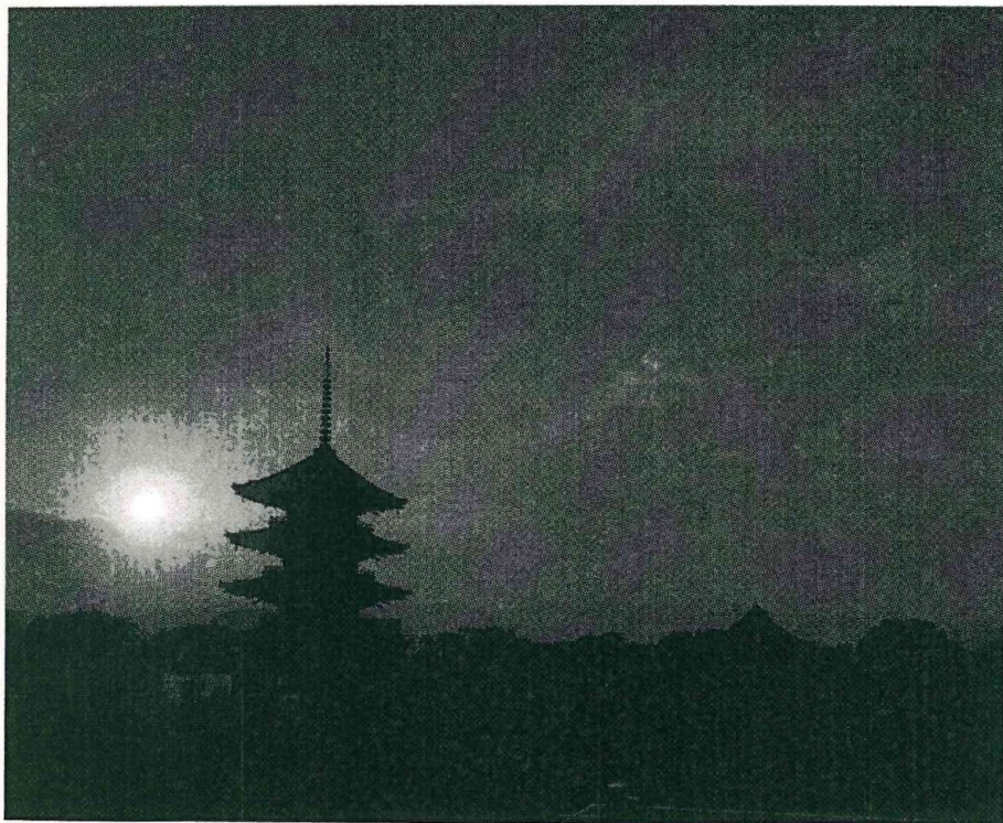
To-ji Temple, Kyoto Japan

Evening Prayer 29 June 2006 Feast of Saint Peter and Saint Paul (ca. 67)