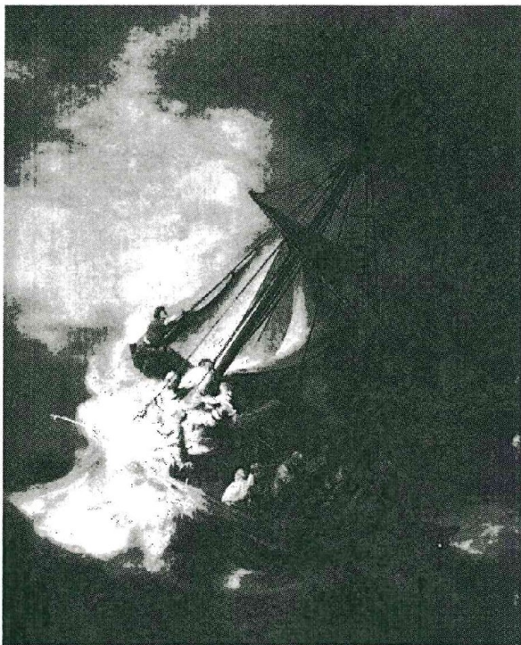
Christ in the Storm on the Lake of Galilee (1633) Rembrandt (1606-1669)