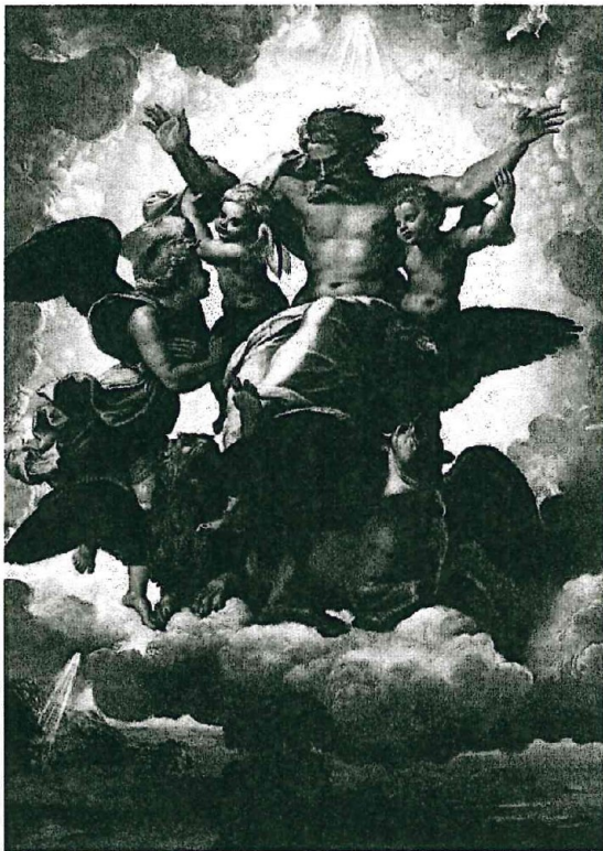
The Vision of Ezekiel (1518) Raphael (1483-1520)