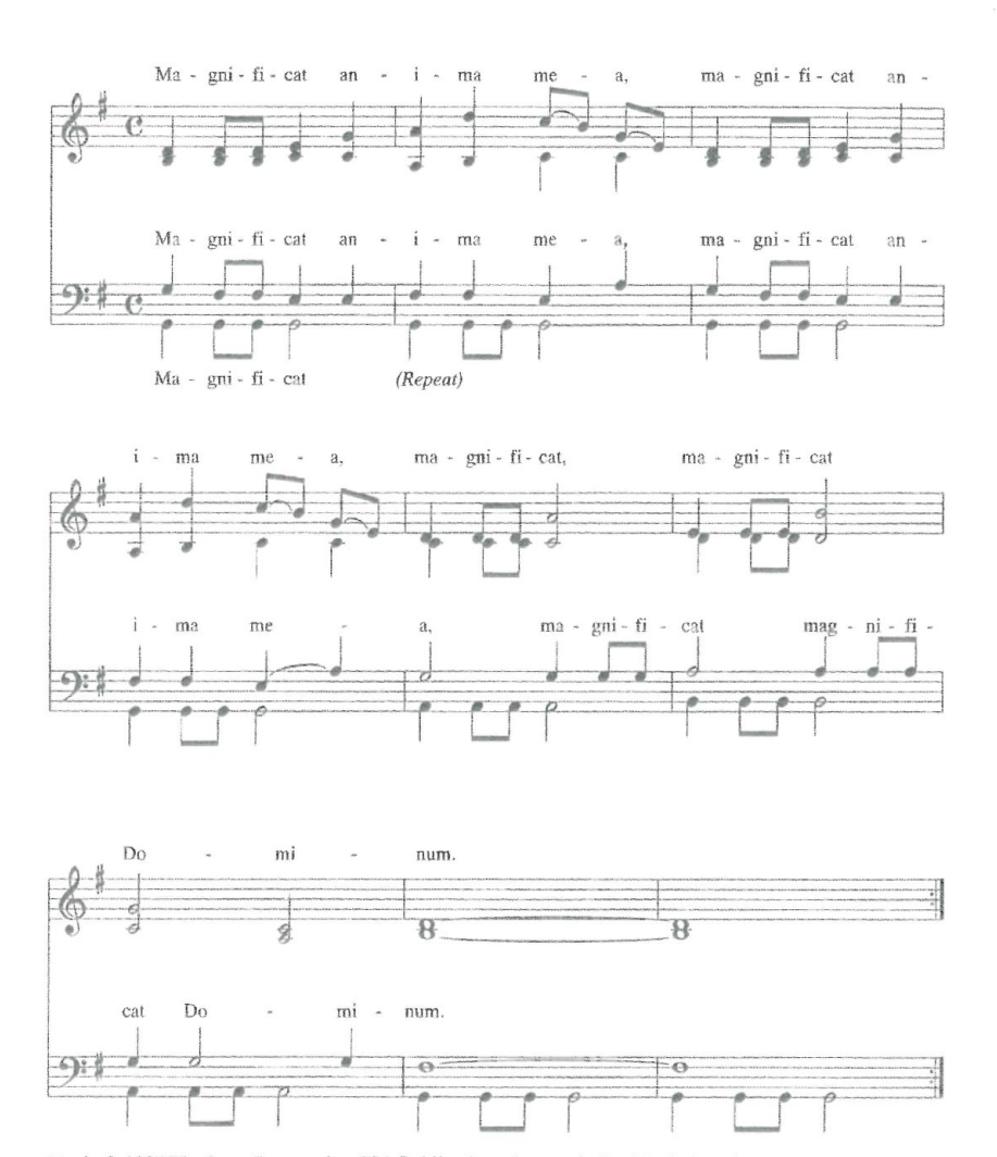
Music © 1987 The Iona Community. GIA Publications, Inc. exclusive North American agent.